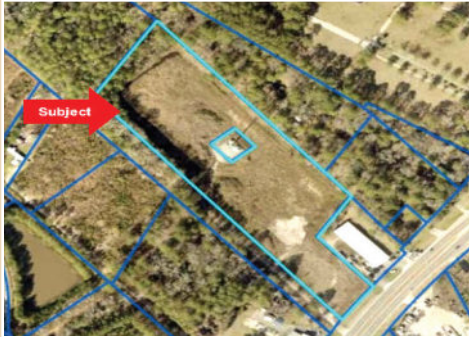
Property Address: 5620 Ogeechee Rd (Highway 17), Savannah, GA 31405