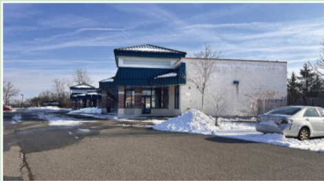
Property Address: Address: 1571 Route 46, Parsippany, NJ 07054