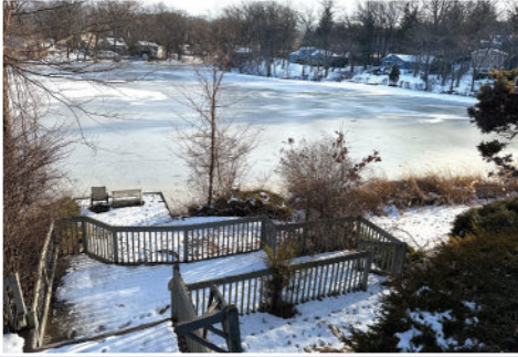
26 Glenwood Place - Charming single-family Ranch Home Two tiered deck with magnificent views