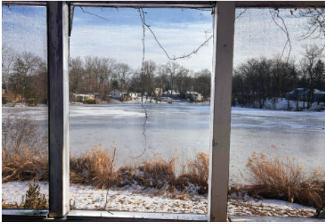
24 Glenwood Place - Cozy home with Picturesque Lake views ready for your renovation