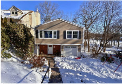
3 Hillside Road

Residential Property Previews 12-2 pm: Saturday, February 28 th & Saturday, March 7 th 12-2 pm