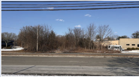
Property Address: 315 Old Bloomfield Ave, Parsippany, NJ 07054