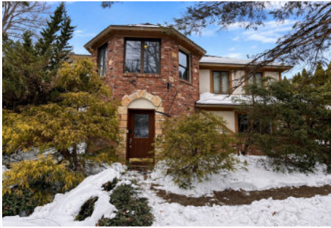
25 Upper Rainbow Trail