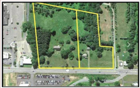
Property Address: 1461-1511 Blakeslee Boulevard Drive E, Lehigh, PA 18235