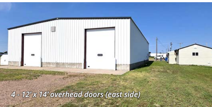
4 - 12' x 14' overhead doors (east side)