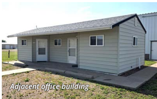
Adjacent office building