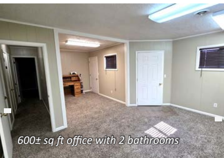
600± sq ft office with 2 bathrooms