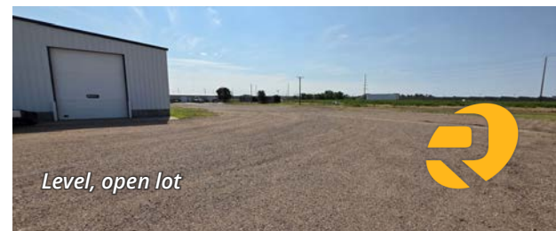
Level, open lot