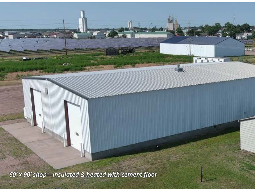
60' x 90' shop—Insulated & heated with cement floor