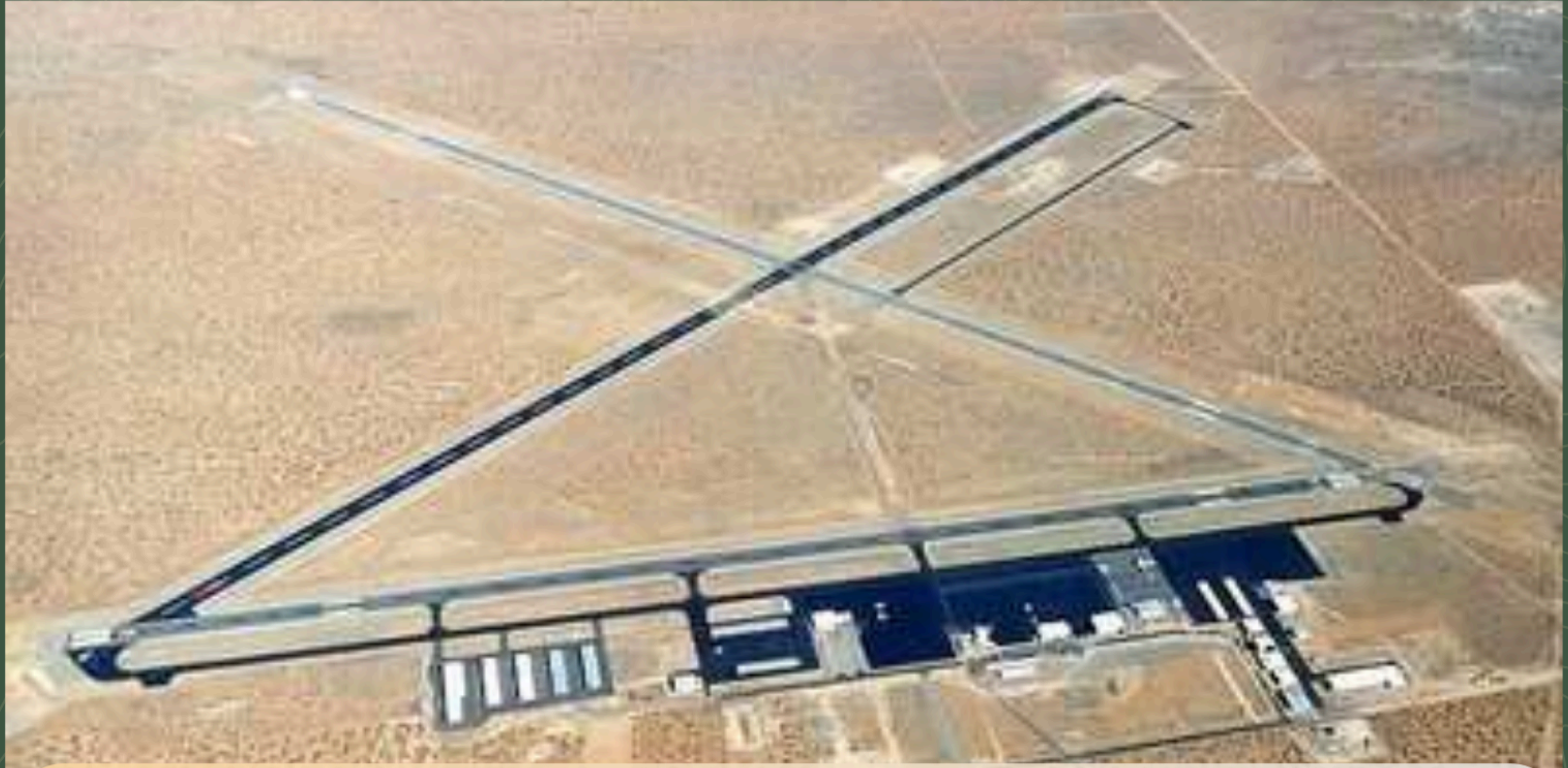
Las Cruces International Airport